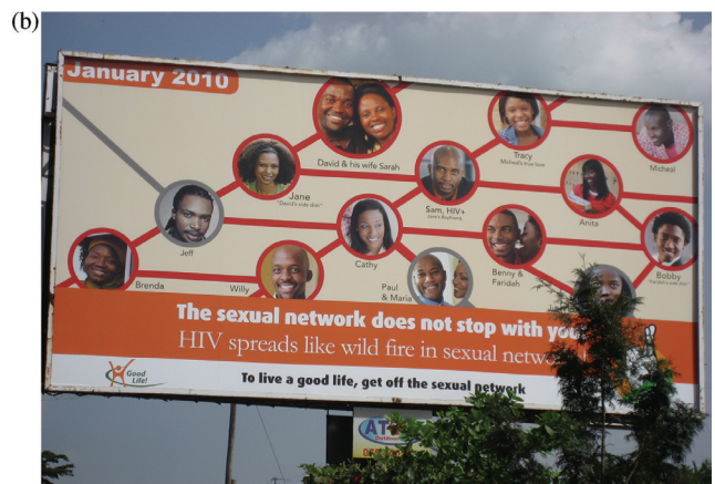
Fig. 2. Two posters from Uganda: (a) November 2009 and (b) January 2010, highlighting the fact that HIV spreads in sexual networks.